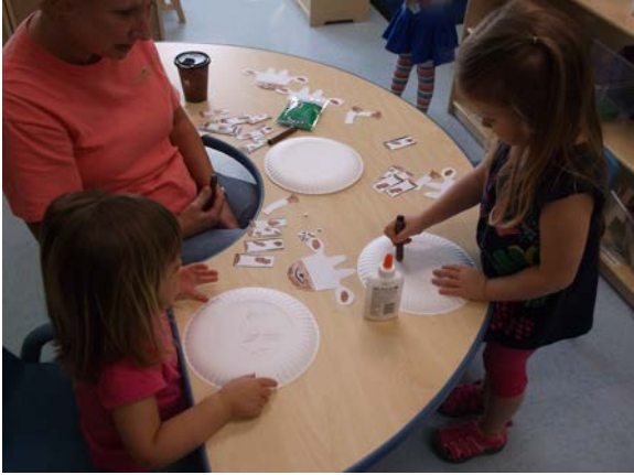
Making paper plate cows