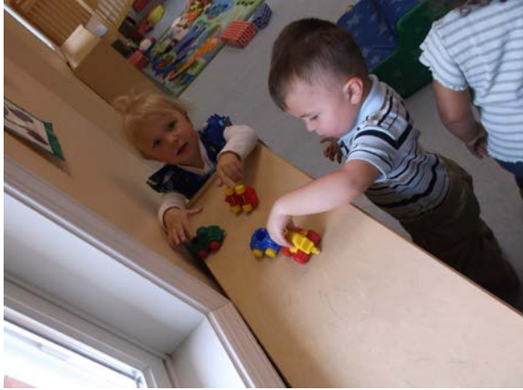
Fun with trucks!