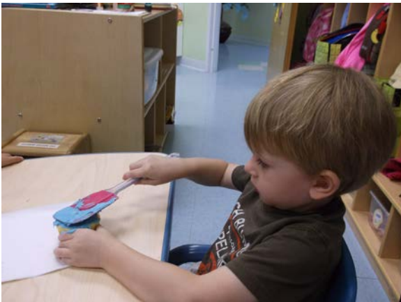
Earth Day cupcakes!